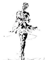
GRAYSWAN SCI AGGRESSIVE FUND OF FUNDS