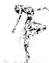
GRAYSWAN SCI CAUTIOUS FUND OF FUNDS

The highest & Lowest growth rate generated over 12 consecutive calendar months, in the period measured. The growth rate is not annualised.