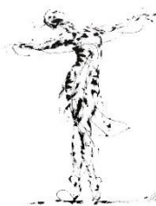
GRAYSWAN SCI MODERATE FUND OF FUNDS