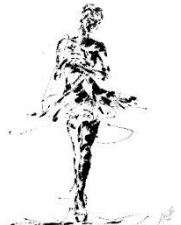
GRAYSWAN SCI AGGRESSIVE FUND OF FUNDS