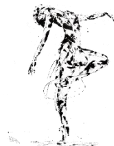
GRAYSWAN SCI CAUTIOUS FUND OF FUNDS

The highest & Lowest growth rate generated over 12 consecutive calendar months, in the period measured. The growth rate is not annualised.