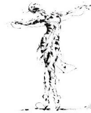
GRAYSWAN SCI MODERATE FUND OF FUNDS